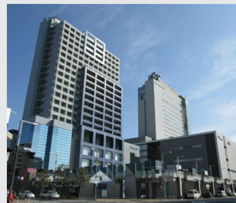
▶ Okayama Convention Center