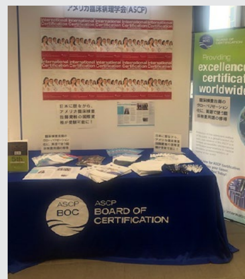
▶ ASCP BOC exhibit booth at the 66th Annual Meeting of JSLM.