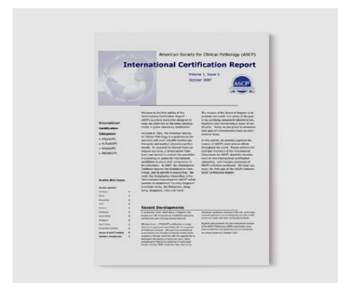
First issue of the International Certification Newsletter (known then as the International Certification Report), October 2007.

Welcome to the final edition of the ASCP BOC International Certification Newsletter (ICN). Our first edition of the ICN was published back in October 2007. In that issue, we stated that the ICN is "designed to keep you informed on the latest developments in global certification." For the past 13 years, we have enjoyed doing just that—sharing with you the latest news on how BOC international certification is improving the medical laboratory profession around the world.